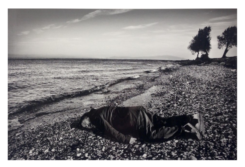
Untitled by Rohit Chawla (2016), photograph on Hahnemuhle archival paper, H102 x W153cm

Completing this exhibition is a haunting image taken for the magazine India Today. Part of a series of projects engaging with the refugee crisis in Syria, controversial Chinese artist and activist Ai Weiwei worked together with Rohit to recreate the image of drowned infant Alan Kurdi, whose lifeless body was washed up on a beach near the Turkish town of Bodrum in September 2015. Working on the Greek island of Lesbos, a key point of entry for many refugees into the European Union, Ai Wei Wei and Rohit's striking and iconic image makes a strong political and humanitarian point, highlighting the plight of thousands of people desperately searching for a better future.